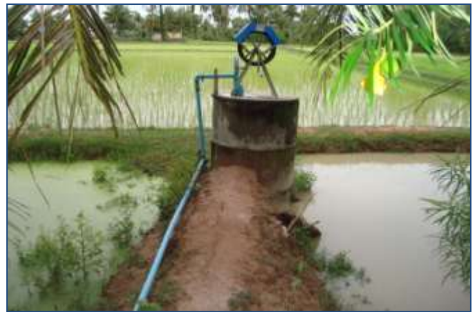
Irrigation and domestic water pump