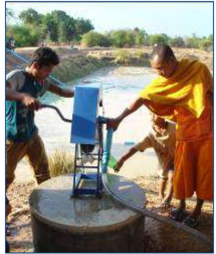
Pond pump with hose to water containers