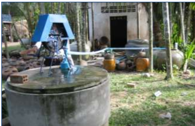
Easy water for rice wine makery, production doubled