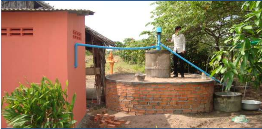
Pipes for pump to toilet, laundry and house