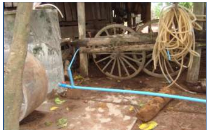
Easy ROVAI water to pig stall through small pvc pipe