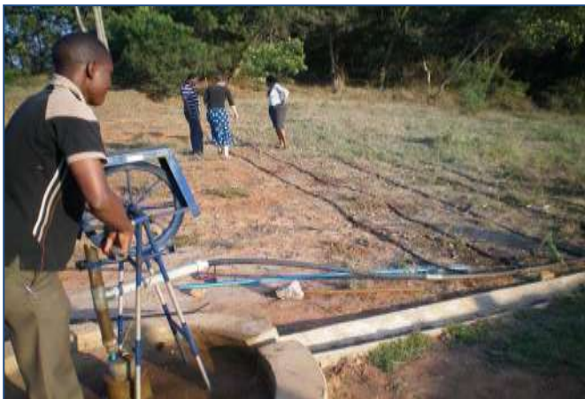
Drip irrigation rope pump in Malawi